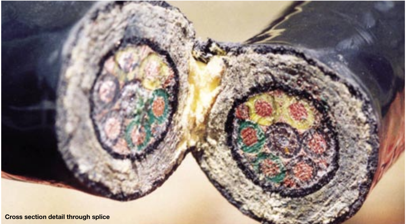
Cross section detail through splice

Splicing on conventional ropes is centuries old, however, long established splice designs are not necessarily suitable for high performance synthetic fibre materials and their high technology, high cost applications. TTI is a world leader in the design and proof testing of innovative splices.